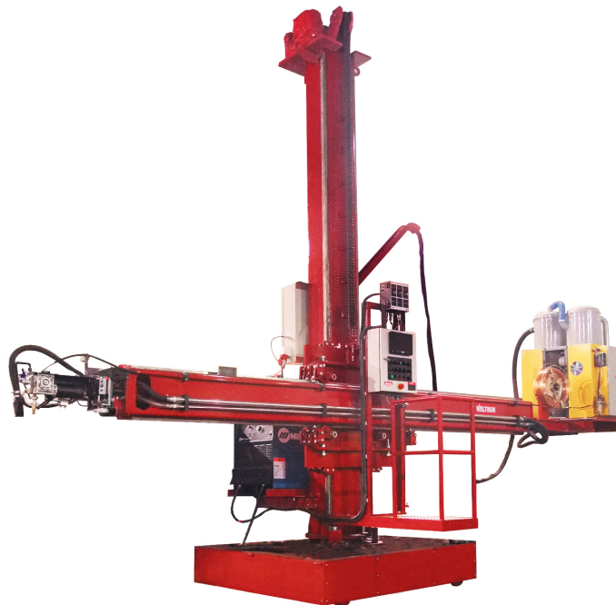
Pic. Show MZT head mounted on 3x3 C&B